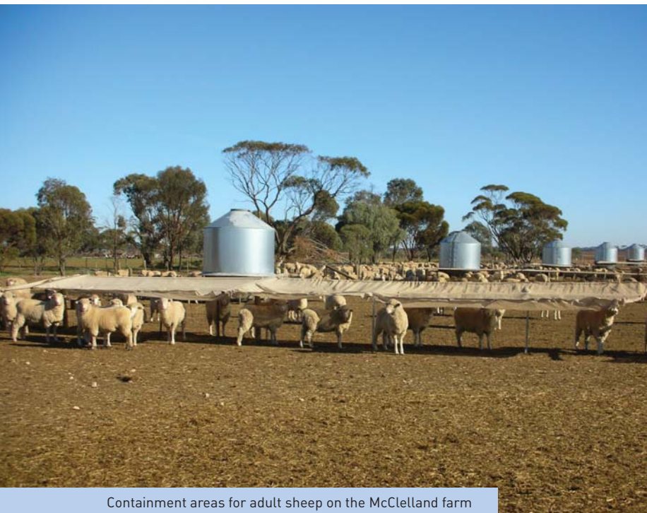
Containment areas for adult sheep on the McClelland farm

Dry sowing has become an integral part of the McClellands' strategy to cope with more low-rainfall years. Sowing some crop by date and incorporating as much straw as possible on the top of the seed bed has helped produce better yields for many farmers across the region.