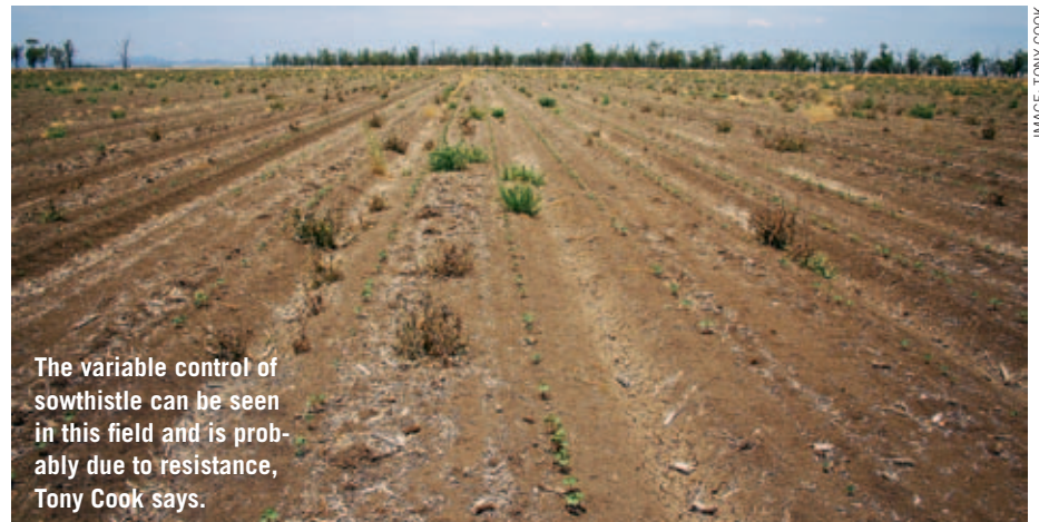
The variable control of sowthistle can be seen in this field and is probably due to resistance, Tony Cook says.

"We have plants surviving the 4L/ha treatment, especially