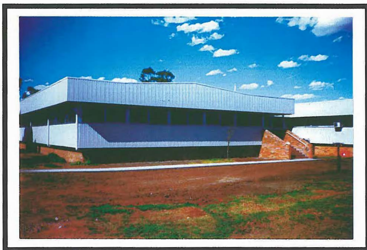
COTTON BREEDING & PLANT PATHOLOGY WING