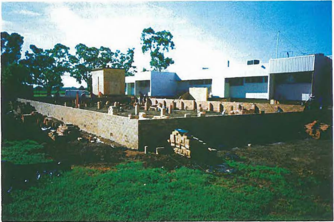
COMPLETION OF BRICKWORK