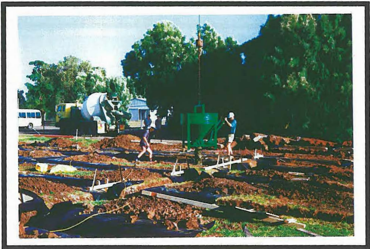
CONCRETE POUR FOR THE FOUNDATIONS

The Cotton Breeding & Plant Pathology Wing was designed to match the existing Administration Building. Because of the highly reactive soil, the concrete footings were designed 900mm deep x 400mm wide, with external & internal interlocking footings. The suspended concrete flooring system used was 'Ultrafloor' because of the cost saving. The Ultrafloor system involves precast concrete joists placed at determined centres onto the support structure and fibro cement sheeting laid between the joists. The mesh is placed into position and concrete poured.