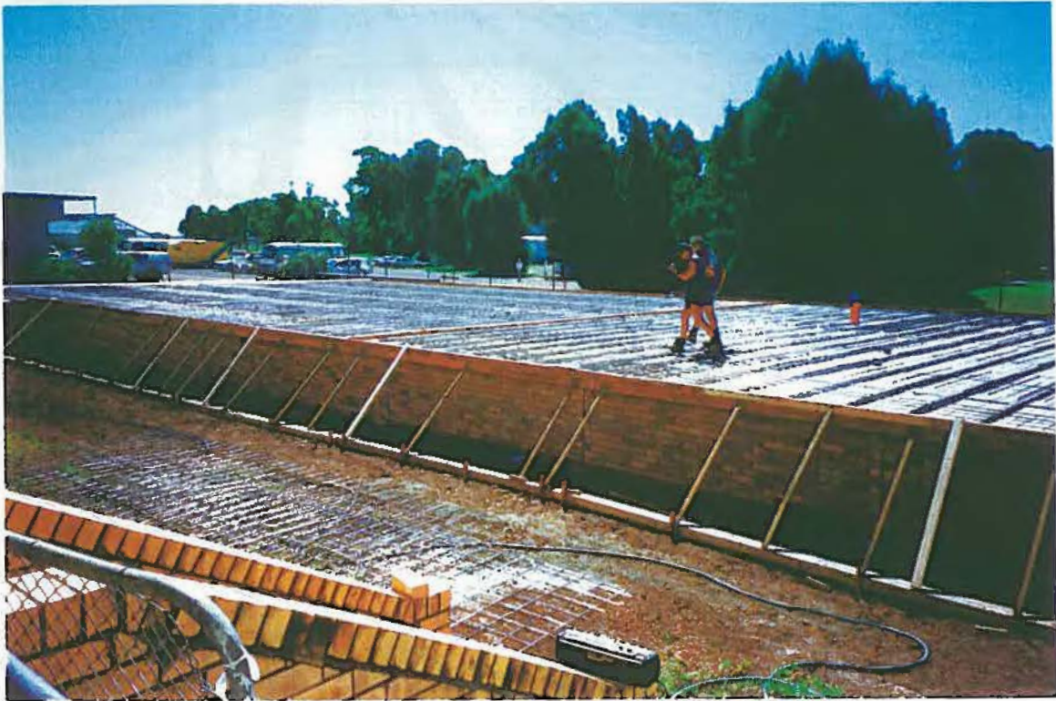
CONCRETE FLOOR SLAB