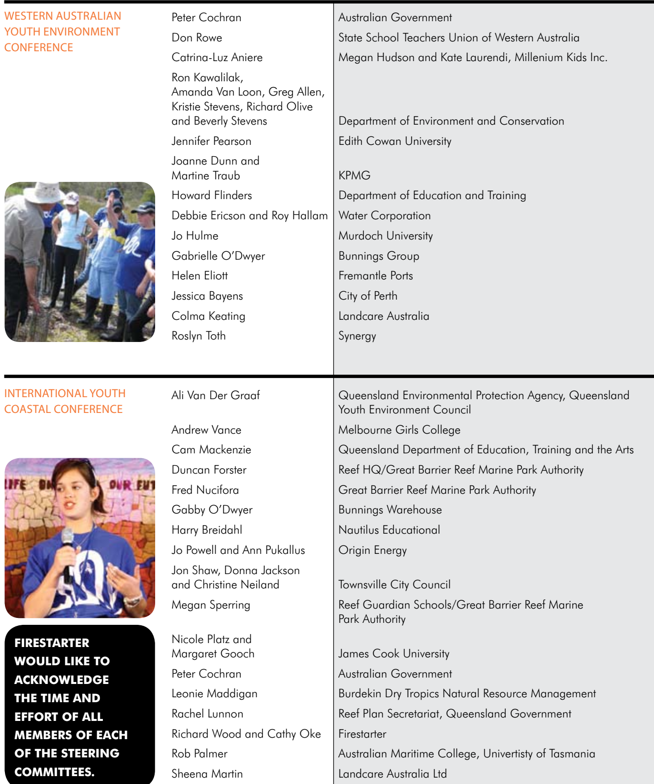
TABLE 2: STEERING COMMITTEES' MEMBERSHIPS (Continued)