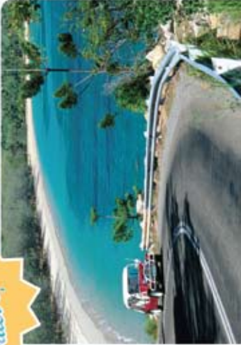
Left: Magnetic Island