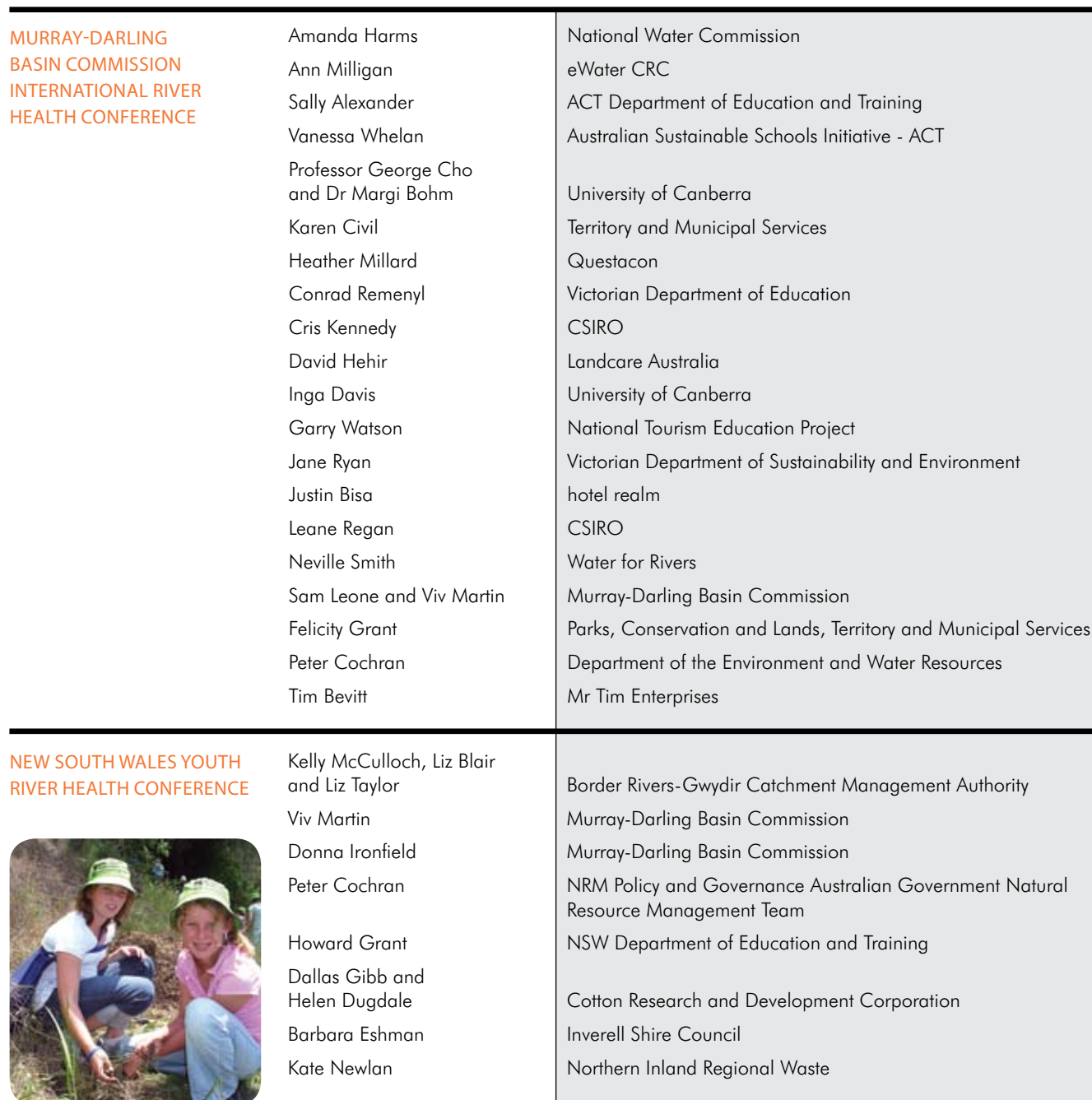
TABLE 2: STEERING COMMITTEES' MEMBERSHIPS