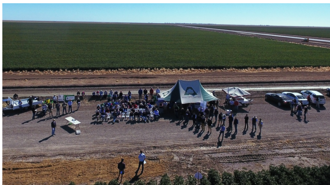
Photo from the field day at Auscott Cobran.

Discussions with other researchers from DPI and CSIRO about the potential to take the research further and where the gaps are. The hopes are that the data can be used as a base for further research.