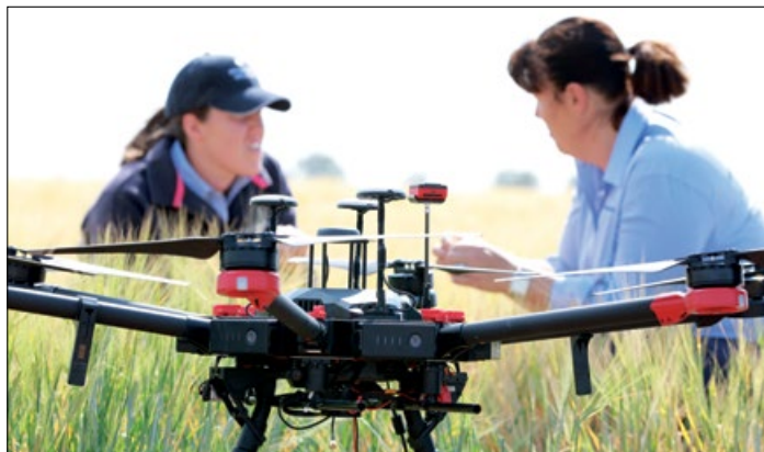
FluroSat utilises drone and satellite imagery in infra-red bands to give users crops status information.

"This start-up coaching has helped us with the formulation of business/product hypothesis and design of experiments to validate that in the quickest time possible.