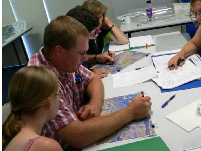
Photo 1 Members of the Callandoon Area Wide Management Group mapping their riparian areas at a Land and Water Management workshop held at Goondiwindi

Due to the success of this workshop others are being run in catchments such as the Namoi and Gwydir in collaboration with the Catchment Management Authorities in those areas. With the assistance of these regional natural resource management groups growers will be able to access satellite imagery, maps, technical advice as well as funding for audit costs and the implementation of their action plans.